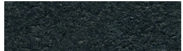
Swatch No. 106

Actual color of finished product may vary.