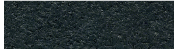
Swatch No. 106

Actual color of finished product may vary.