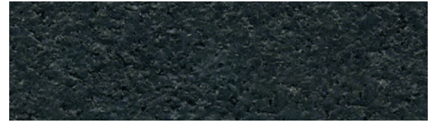
Swatch No. 106

Actual color of finished product may vary.